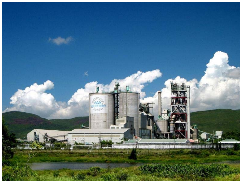
Nghi Son Cement Corporation's plant