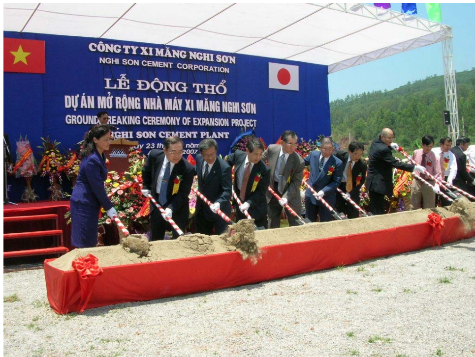
2nd Production Line groundbreaking ceremony (April 23, 2007)